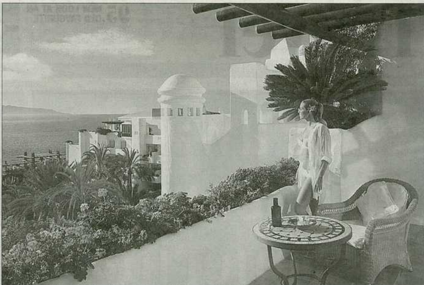
ROOM WITH A VIEW: Take in the spectacular vista of neighbouring La Gomera from the terrace of your room at the Jardin Tropical