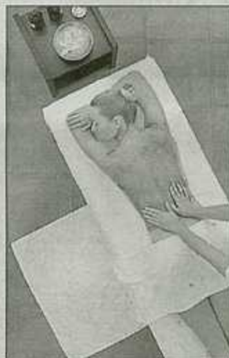
BLISS: Choose from a menu of treatments in the hotel spa